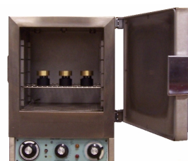
Time Consolidation of 3 samples in a climate chamber